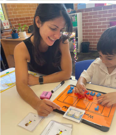
This week was a joyous week of celebration and creativity with Naw Ruz being celebrated both at home and on school grounds.