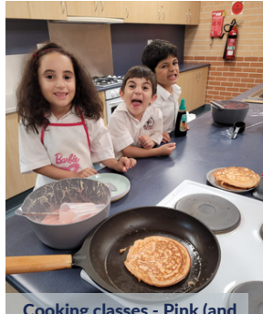
Cooking classes - Pink (and red) pancake party!

Watching the children learn in a variety of different environments and engage so well with the content is heartwarming. Our older students have been demonstrating maturity and leadership through respecting the needs of those younger than themselves, and often putting their own wants second. Well done!