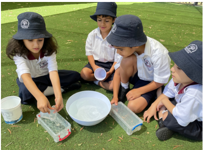
Measuring and comparing the capacity of containers