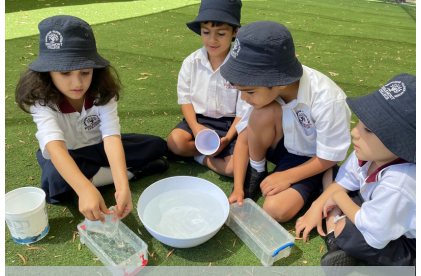
Measuring the capacity of containers