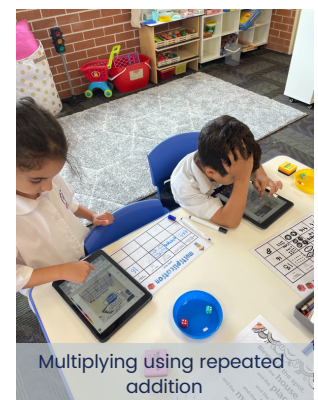
Multiplying using repeated addition