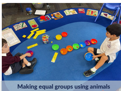
Making equal groups using animals