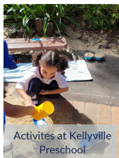
Activities at Kellyville Preschool