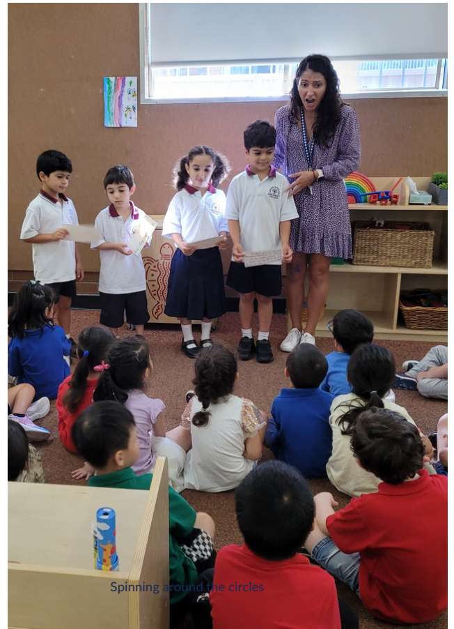
Spinning around the circles

Preparations are under way for our Open Day on 2 April from 2pm to 4pm. Don't forget to register your attendance using the QR code on page 3. Please feel free to invite friends who might be interested.