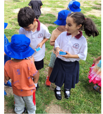
Visiting Kellyville Preschool to share the significance of Ayyám-í-Há and share our gifts and planned experiences with them.