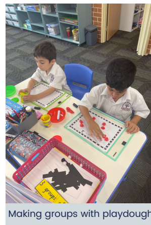
Making groups with playdough

Stage 1 have also been learning more about the /m/ phoneme. Specifically the digraph 'mb' and the rule that it always goes at the end of words and the B is silent. They have created artworks and creative sentences using the /m/ sound and learnt more about verbs in context.