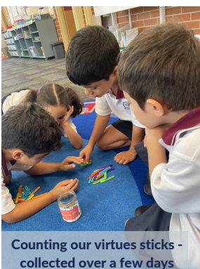
Counting our virtues sticks - collected over a few days