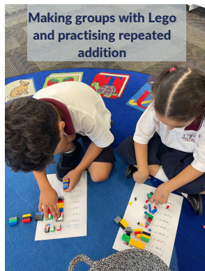
Making groups with Lego and practising repeated addition