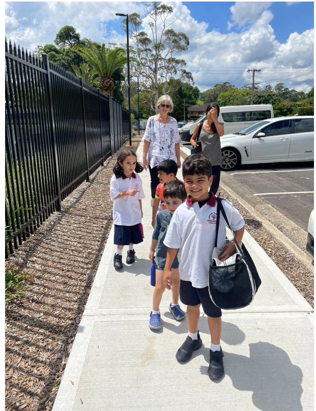
On our way to our first excursion.