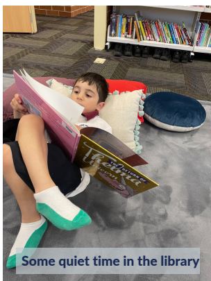
Some quiet time in the library