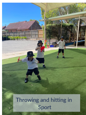
Throwing and hitting in Sport