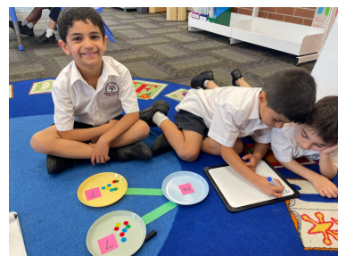
Practising creating number bonds with hands-on materials and writing number sentences to match