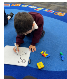
Writing combinations of number bonds