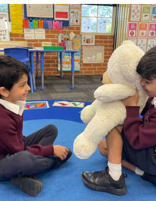
Reading, making groups and sharing with playdough, writing creative stories, comprehension of non-fiction texts, creating clocks and telling time, sounding out words on our word-making mats and practising and understanding perseverance through role play