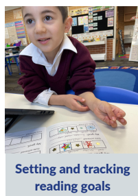
Setting and tracking reading goals

We particularly enjoyed having some volunteers visit us to see how our school works and appreciated their support in English and Maths groups.