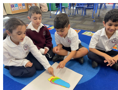
Measuring the area of our feet by superimposing them and comparing the space they take up