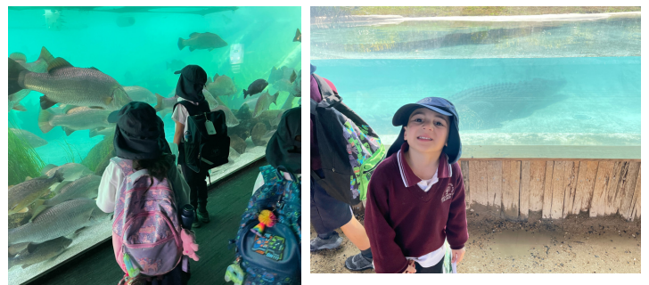
Our trip to Sydney Zoo