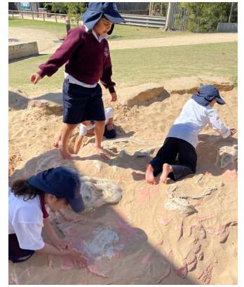
Zoo adventures - exploring animal enclosures, new playgrounds with fossil finds and sharing our creative talents during news