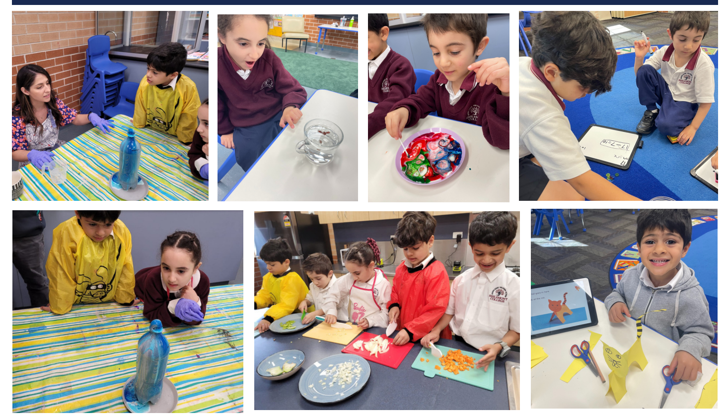
Participating in a range of science experiments, collabortaive problem solving in maths, cooking a meat pie, and reading procedures and following them to make artworks.