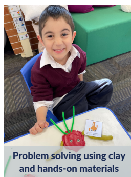
Problem solving using clay and hands-on materials