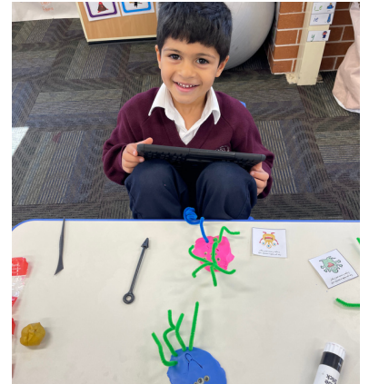
Many hands-on experiences learning about place value and number concepts, problem solving using riddles and clay, expanding methods of subtracting and exploring new parks.