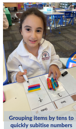
Grouping items by tens to quickly subtract numbers

In mathematics, students have been participating in hands-on experiences that reinforce concepts, such as grouping, to quickly recognise a certain number of objects. Outdoor spaces have also been utilised, with students appreciating that learning can happen in a variety of places, not just in a classroom or at a desk. They have used hands-on materials to estimate and count the number of objects in a collection. They have also supported one another in their learning by filming each other explain their reasoning and asking relevant questions to elicit important information.