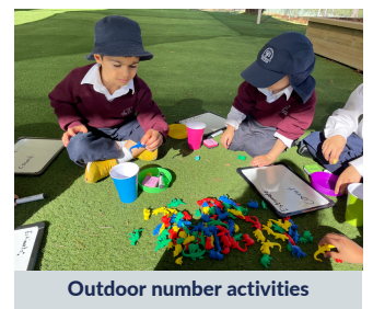
Outdoor number activities