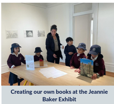
Creating our own books at the Jeannie Baker Exhibit

Sport - Thursday - please wear your sports uniform, bring your drink bottles and don't forget your hats.