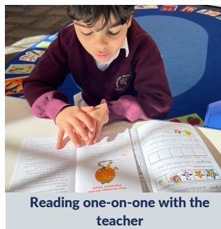
Reading one-on-one with the teacher

Reading instruction has continued in one-on-one and small group sessions. This has allowed for highly differentiated instruction and opportunities for guided and scaffolded lessons that are targeted to the individual students.