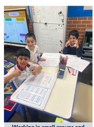
Working in small groups and with focused teacher instruction