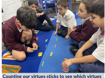
Counting our virtues sticks to see which virtues we practised well this week