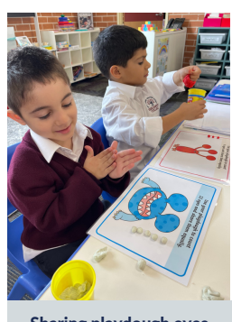
Sharing playdough eyes between monsters

Once again, this learning process has been exciting to watch unfold and explore with each student, moving at their own pace and slowly unpacking the content.