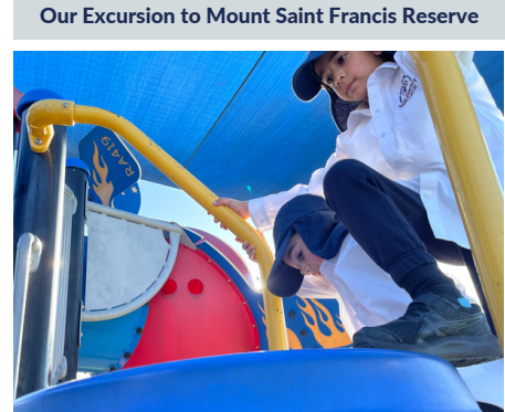
We are all very much looking forward to this special excursion.