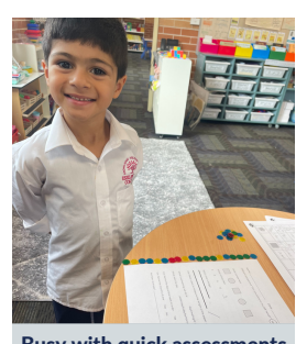
Busy with quick assessments of learning this week