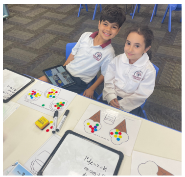
Just some of the great things happening this week: Revisiting handwriting of tricky letters, grouping and sharing objects, writing excellent descriptions of our favourite characters from books, reading for enjoyment and learning our sight words