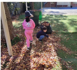
Being of service and helping clear autumn leaves