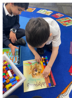
Comparing the surface area of two objects.

Mathematics has involved looking at the surface area of different objects and explaining how we know one area is larger or smaller than another. We have focused on superimposing objects and seeing whether the object underneath is visible, as well as covering the surface with a uniform informal unit (such as unifix cubes) and comparing the number of units taken to fill the area of two surfaces.