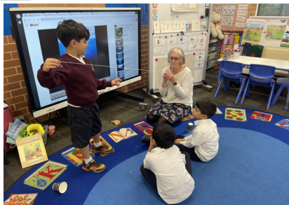
Exploring vibrations in music through string