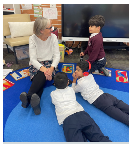
Learning about different genres of music