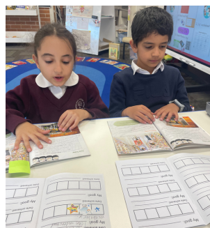
Revising our sounds using interactive technology and reading to achieve our goals

descriptions of characters from the text we have been studying. The students have been focusing on using the conjunctions 'and', 'but' and 'because' in order to effectively compare characters. Something I was personally thankful for, was seeing all of the students complete their writing task without sharing their hesitations or discontent about doing so. Writing has been a challenging task for many this year, however, with encouragement and perseverance they completed the task independently and with joy.