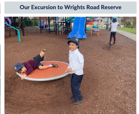
Our Excursion to Wrights Road Reserve