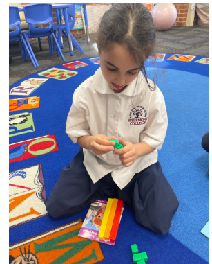
Using unifix cubes to measure the area of a book.